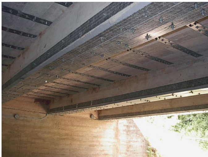
The posted load for this bridge that spans the Meramec River in Missouri was increased from 10 tons to 18 tons by installing SAFSTRIP® using the MF-FRP system.