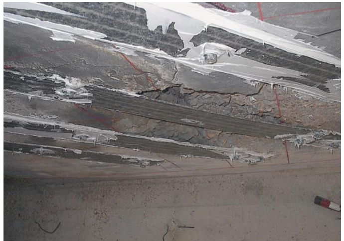
Severe deterioration prevented the application of a bonded strengthening system to this bridge in Pulaski County, Missouri, but MF-FRP applied SAFSTRIP® was able to repair the bridge.