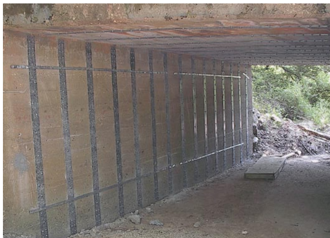
The abutment and deck of this bridge in Phelps County, Missouri, was strengthened using SAFSTRIP®.