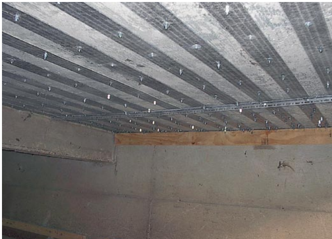
This bridge, located in St. James, Missouri, was load posted at the time of strengthening. After mechanically attaching SAFSTRIP® with concrete wedge bolts and anchors, the bridge load limit was raised to 20 tons.