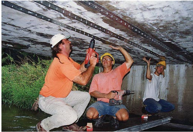
Workers installed SAFSTRIP® on this bridge in Edgerton, Wisconsin, using the MF-FRP system. The load rating for the bridge increased from HS-17 to HS-25 as a result.