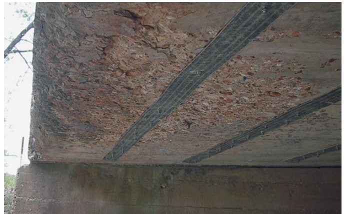
As a result of a SAFSTRIP® retrofit, the existing 12-ton load posting for this bridge in Phelps County, Missouri, was removed.

3 Modulus design values are not reduced in accordance with ACI 440.2R-02